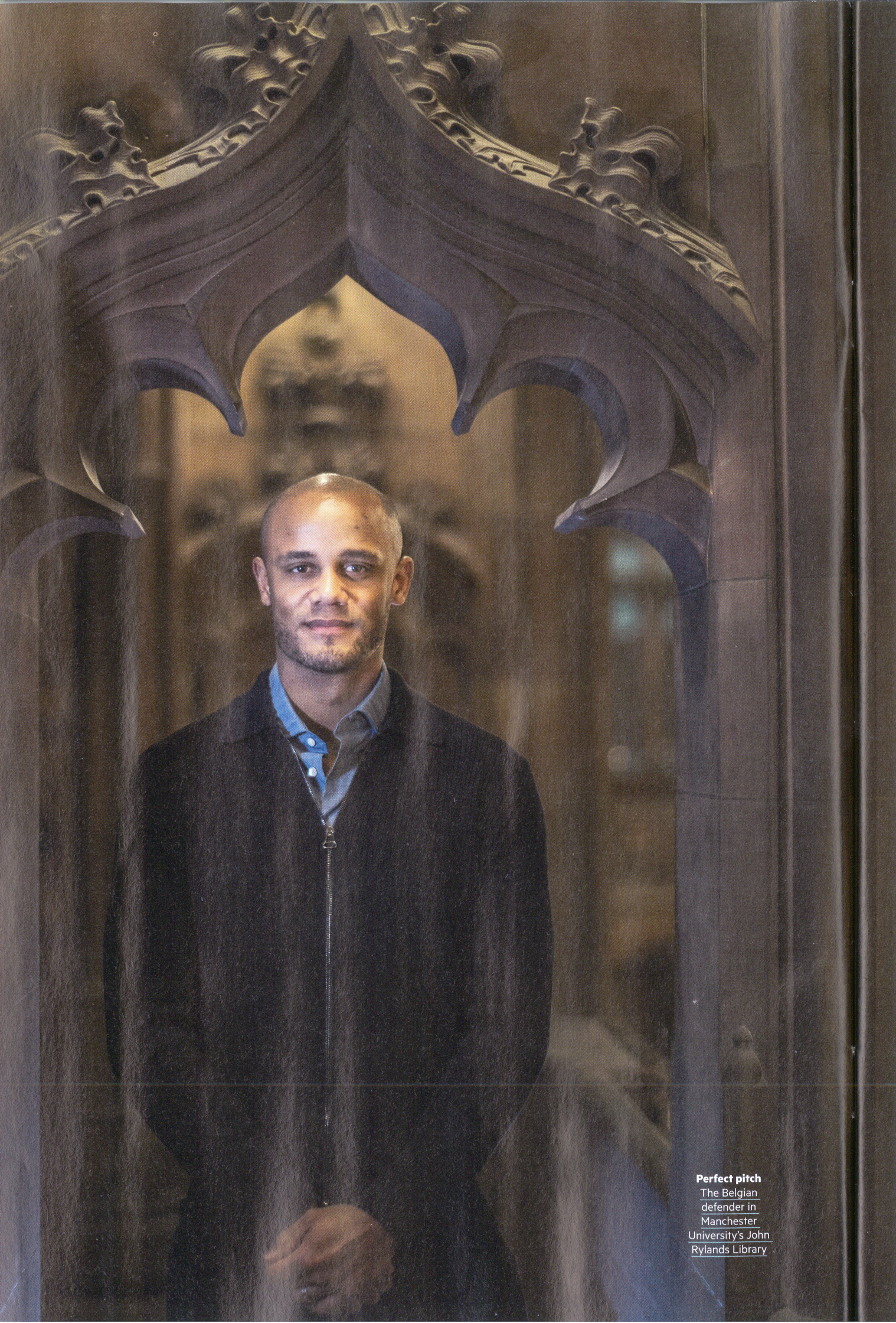
Perfect pitch The Belgian defender in Manchester University's John Rylands Library